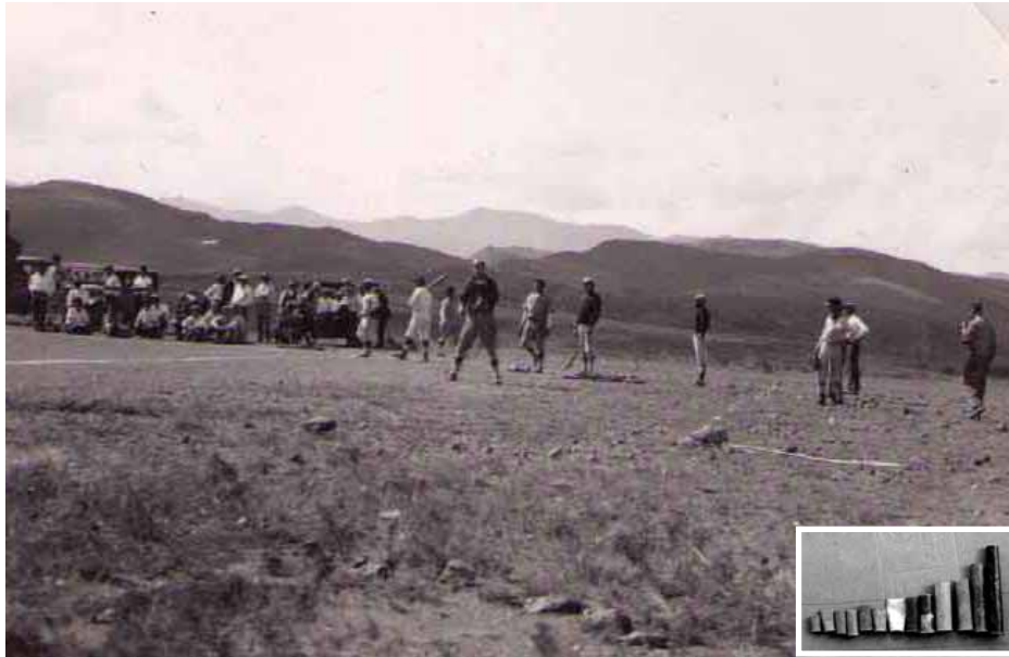
Baseball on the mesa. The area may have been used as a shooting range before it became a baseball field. Inset: A partial array of cartridges found on the ballfield site.