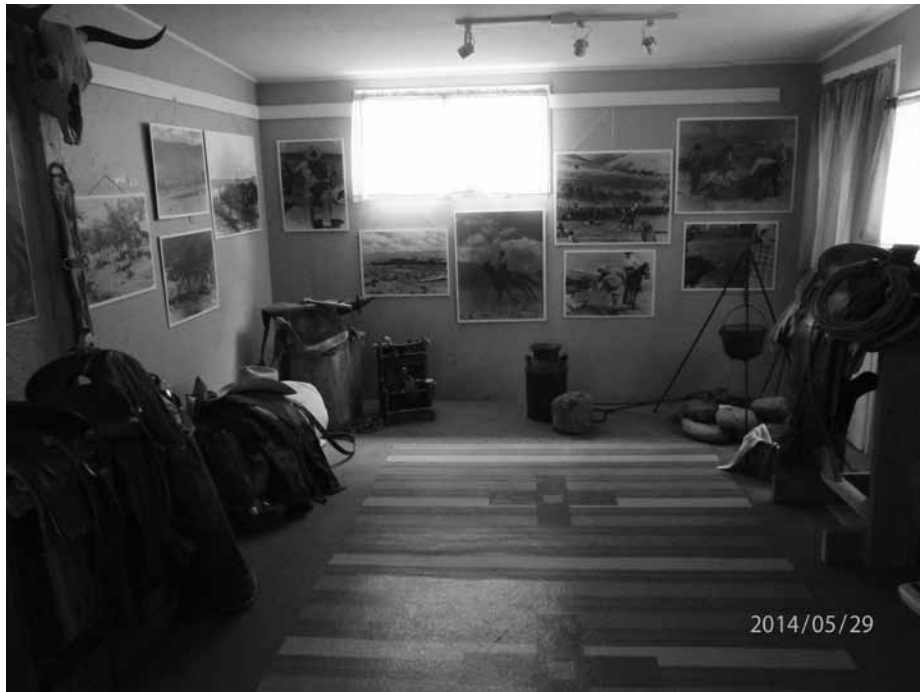
Ladder Ranch Display at the Education Center